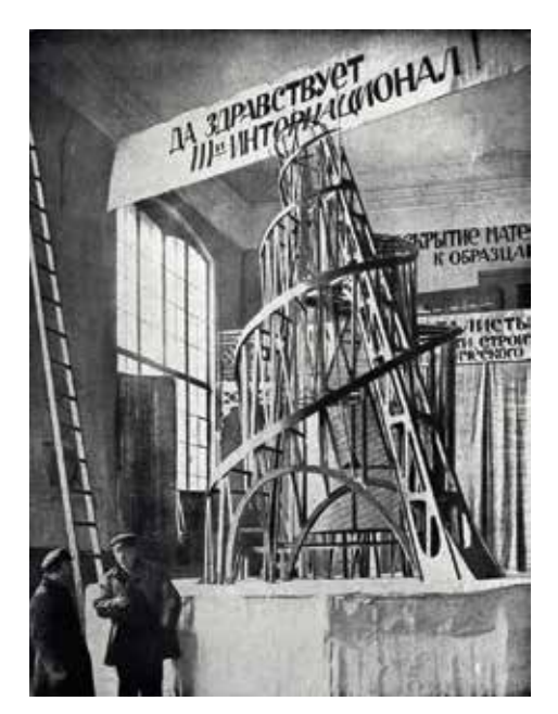
Tatlin, Vladimir E. Monument of a Building for the 3d International, 1919)

Second, we must complement our epistemology (philosophy of cognition) with insights that are not only adequate to the age of the theory of relativity and cybernetics, internet and genetic manipulation, but also adequate to the dying, and extremely dangerous, beast of financial capitalism, of its global terrorism, warfare, and break-up of humanity's metabolism with nature. Marx's constitutive epistemological rule may be phrased as: the object of knowledge is judged by looking backward from the future possibilities, which in feedback with the object provide the normative criteria for judgment.