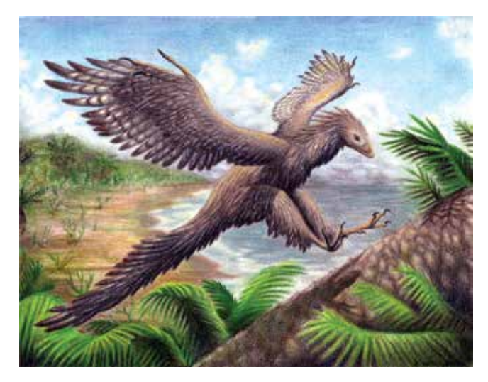
Achaeopteryx (drawn by Emily A. Willoughby)<sup>9</sup>

a short distance, but it may well have ran, leaped, glided, and flapped all in the same day. It might have had a primitive metabolism generating body heat on its own, but its metabolic system probably was not as fine-tuned as warm-blooded animals later, so it had a slower growth rate than most birds. There is a category quarrel in archeo-zoology whether it wasn't after all still a small dinosaur, but the most recent study has restored its status as a «basal bird»; further species of this transitional nature have been found since in China.<sup>8</sup>